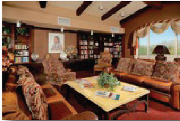
3rd Floor Library at Sierra Pointe

3. Add the sparkling water and stir well. Pour over glasses filled with ice and serve, garnished with mint and strawberries.