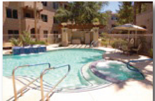
Outdoor heated swimming pool and hot tub

What you need from independent living depends on your own unique situation. Where would you be most comfortable? Here are a few things to keep in mind: