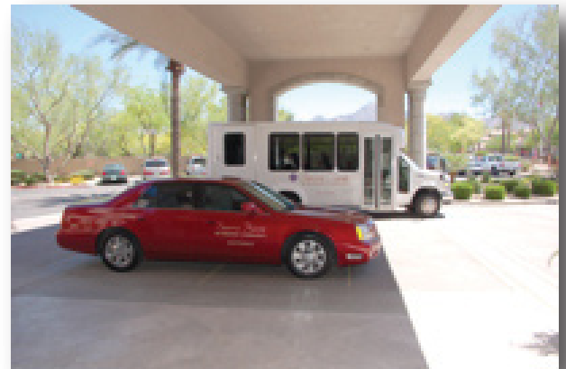
Included transportation at Sierra Pointe

Maintaining a home may be a longstanding source of pride for you, but it can also become a burden as you age. Perhaps your home has a large yard which requires constant maintenance, or maybe it's becoming more and more difficult to clean those extra rooms that are rarely used now that your children are gone. If your home is difficult to access, such as on a steep hill or up stairs, it may be harder and harder for you to leave your home as often as you'd like, leading to more isolation. It's worthwhile to take a look at your current living situation and see if an alternate may give you more freedom and flexibility in the long run.