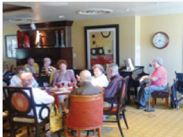
Social hour sing-a-long in Sierra Pointe's Camelback Bistro

Transportation is a key issue. You may live in an area where you must drive to attend social activities, visit friends, and shop. If you find yourself less comfortable with driving, you may find yourself relying more and more on family and friends to get out and about. Independent living usually offers opportunities to socialize on site with peers and may offer some transportation options to outside activities.