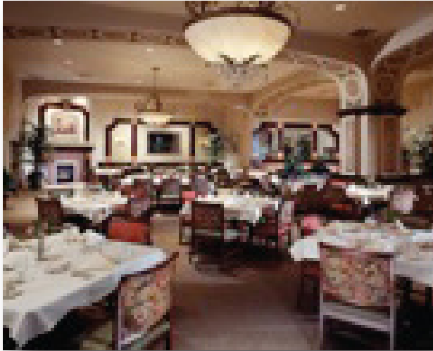
Pinnacle Dining Room at Sierra Pointe

The more isolated you are, the greater your risk for depression and other mental health problems. Independent living facilities can give you a built-in social network of peers, while some even provide structured activities such as a recreation center, clubhouse, or field trips.