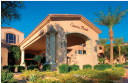
(Loop 101 to Raintree, one mile east to Frank Lloyd Wright)