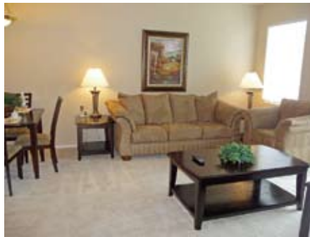
Fully furnished one and two bedroom suites

For as little as $99/night (plus tax) you or a loved one can enjoy all the luxury our residents experience everyday. Like our full-time residents you'll receive: gourmet meals, housekeeping once per week, access to exercise facilities, heated swimming pool & Jacuzzi, library and 20-seat big screen theater. You're also entitled to “chauffeured” transportation and an abundance of social activities! You won't find a more luxurious retirement resort in Scottsdale with gourmet meals and all the other amenities for this price. Requires 60 day minimum lease.