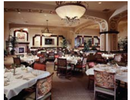
Pinnacle Dining Room at Sierra Pointe